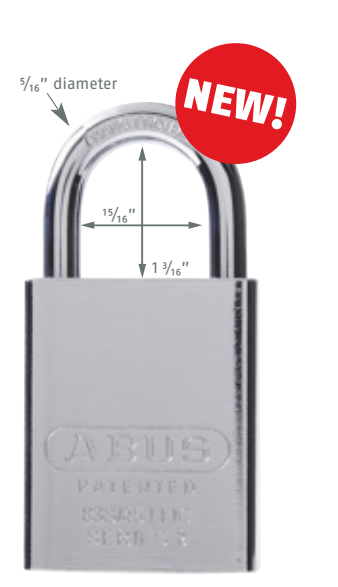
835/45 LFIC S2 1 3/4" width

All the great features of the 83/45 with additional security and that little bit of style