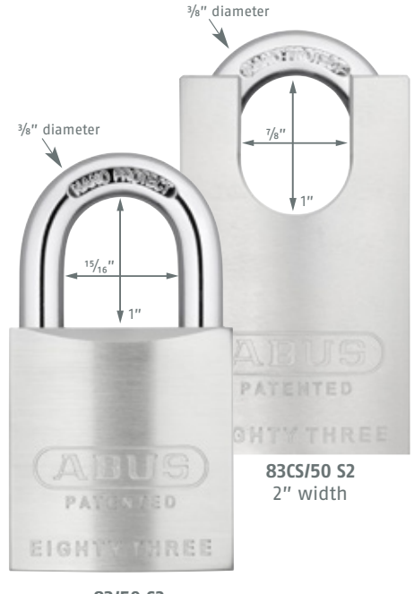
83/50 S2 2" width