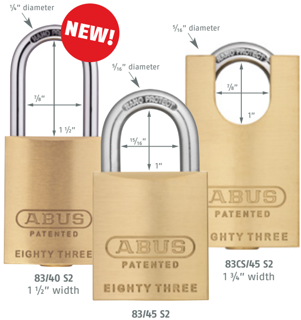
1 ¾" width