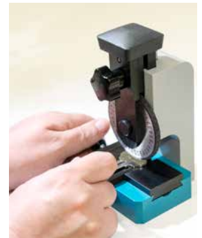
Compact and portable design