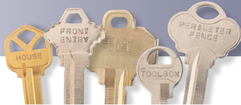
Stamps a variety of key styles and finishes