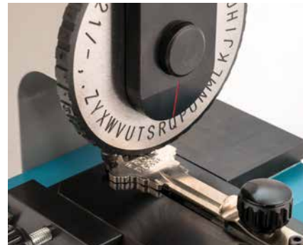
Rotate the character dial into position by loosening or tightening the turn knob